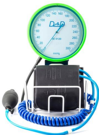
Model presented with Easy Cuff