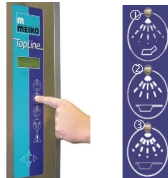
3. Select the cleaning programme corresponding to dirt. Press the programme key. The door closes and the programme starts with the preset A 0 -value automatically.