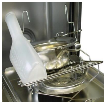
2. Place the washware in the intended position in the utensil holder.