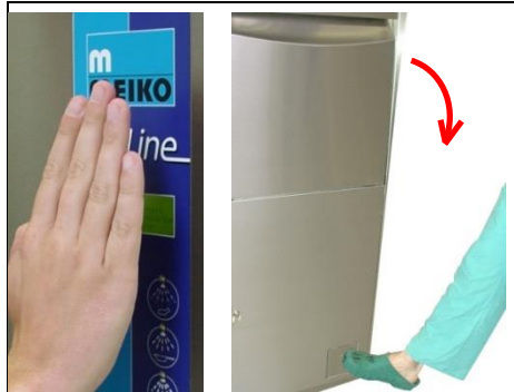
1. Open wash chamber door using the light sensor or foot switch.